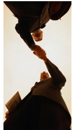
Second-party certifiers should mentor small businesses wherever possible.

One focus of the PS-Prep program is communication and collaboration with small businesses. Program participants can also collaborate and share information, which will provide best practices and other benefits to business owners. In addition to the PS-Prep program, the Red Cross Ready Rating Program and "Open for Business" Online are excellent resources for small business preparedness.