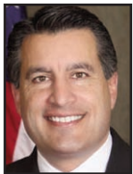
Brian Sandoval, Governor, State of Nevada