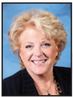
Carolyn Goodman, Mayor, City of Las Vegas