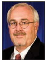
W. Craig Fugate, Administrator, Federal Emergency Management Agency