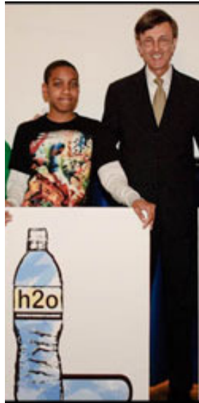
OEM Press Release. March 12, 2009