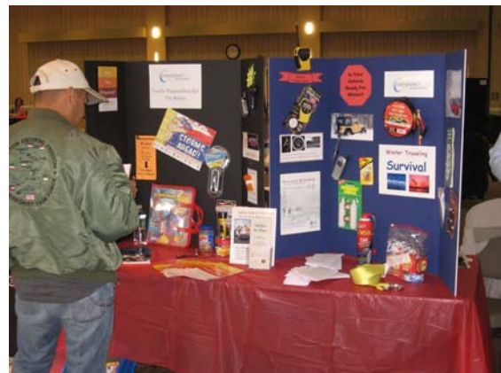
A student explores winter survival information provided by Cass-Fargo Emergency Management.