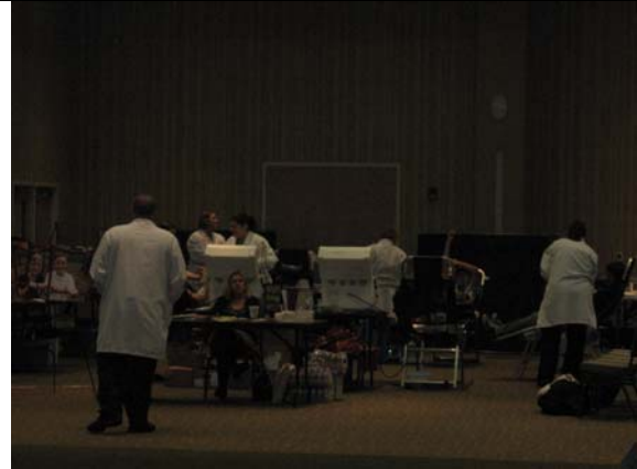
United Blood Service technicians working to assist students and faculty with blood drive donations.