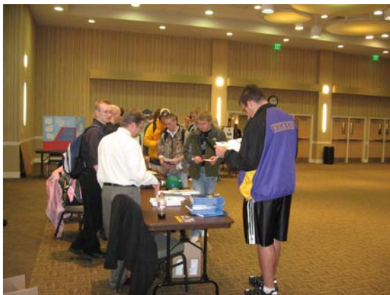
Student Browse informational materials provided by IEMSA

On October 21 st , 2008, NDSU's IEMSA hosted the university's first ever "Emergency Preparedness Expo". The event, an information fair, provided information for students to become better prepared for emergencies and disasters. Organizations that assisted with the event included: American Red Cross, Cass-Fargo Emergency Management, FirstLink Volunteer Network, Cass County Extension Service, and NDSU's Emergency Management Program. The event brought in nearly 400 students through out the day and had a good response from attendees. As part of the event, United Blood Services assisted with a blood drive that collected around 30 pints of blood. The event also featured an extremely successful silent auction that raised nearly $600 to fund organization activities.